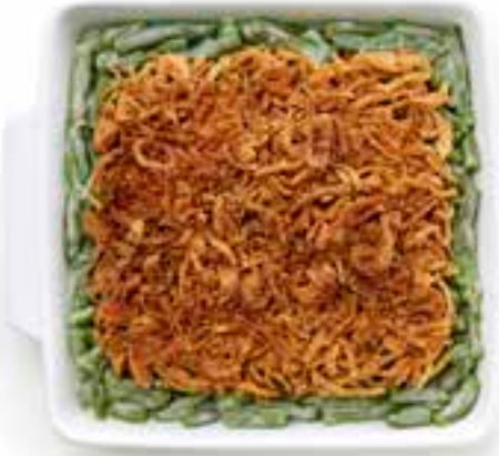
Green Bean Casserole