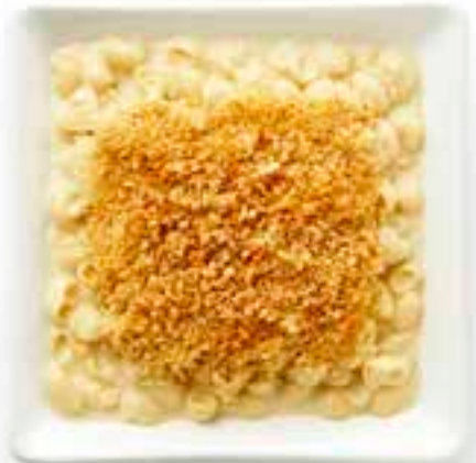
White Cheddar Macaroni