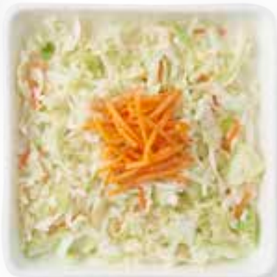
Hickory House™ Creamy Coleslaw