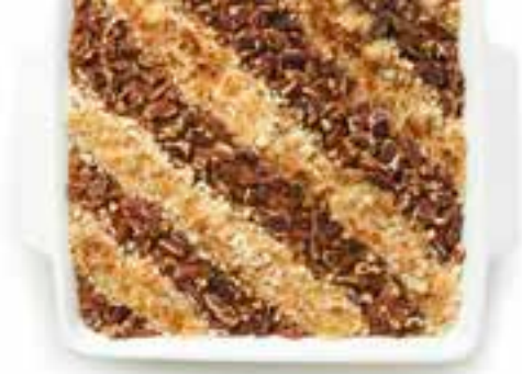
Sweet Potato Casserole