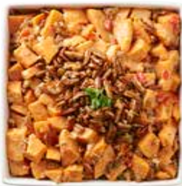
Sweet Potato Ginger Salad