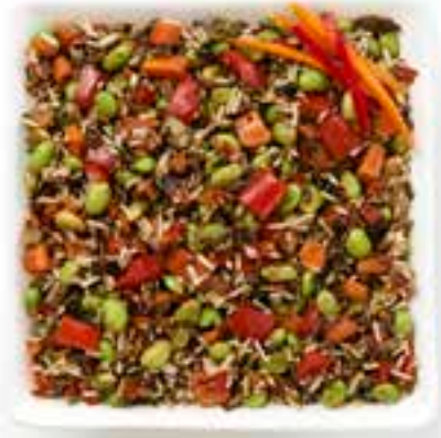
Edamame and Wild Rice Salad