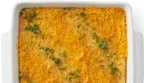
Cheesy Corn Bake