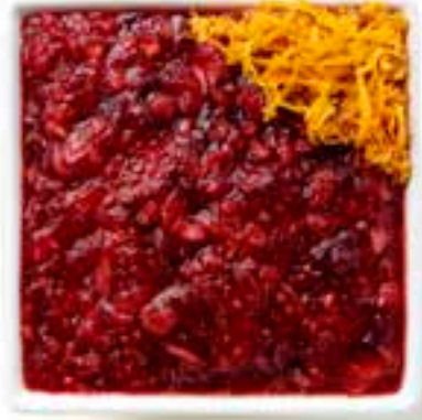
Sweet Cranberry Relish