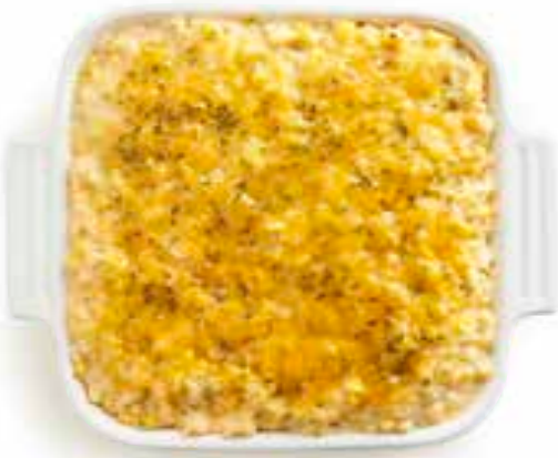
Cheesy Corn Bake